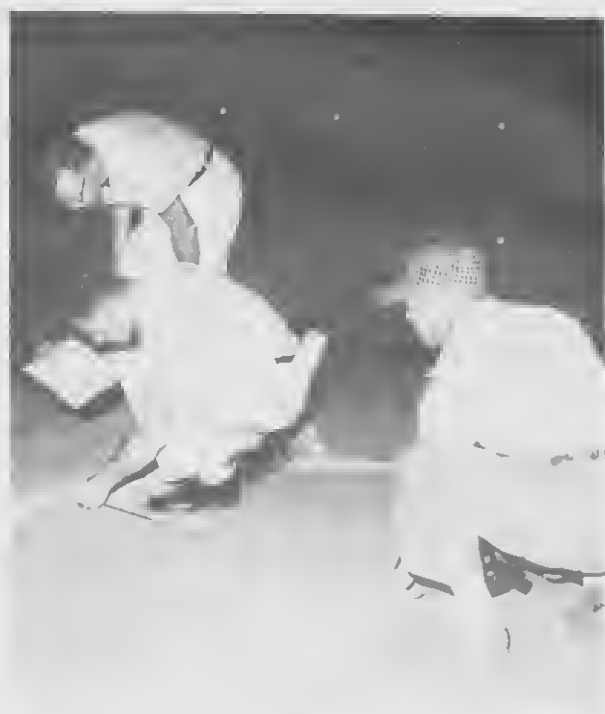
OFFICIALS measure the last fraction of an inch in discus competition (above) while (below) Kyle Spitzer is 2nd. in pole vault.